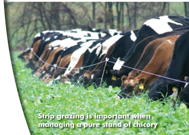
Strip grazing is important when managing a pure stand of chicory