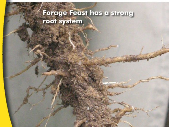
Forage Feast has a strong root system

Forage Feast chicory performs well in less than ideal conditions. Chicory is a deep rooted plant that prefers light to medium soils that are at least moderately drained. Chicory will persist under minimal fertility levels and can tolerate a broad range of conditions. However, with high fertility and appropriate fertilization, Forage Feast will produce impressive yields.