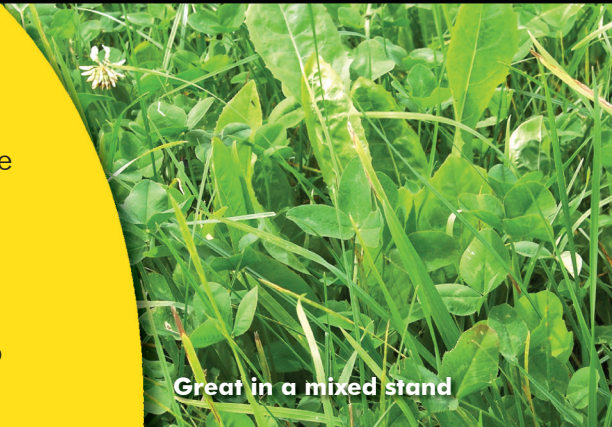
Great in a mixed stand