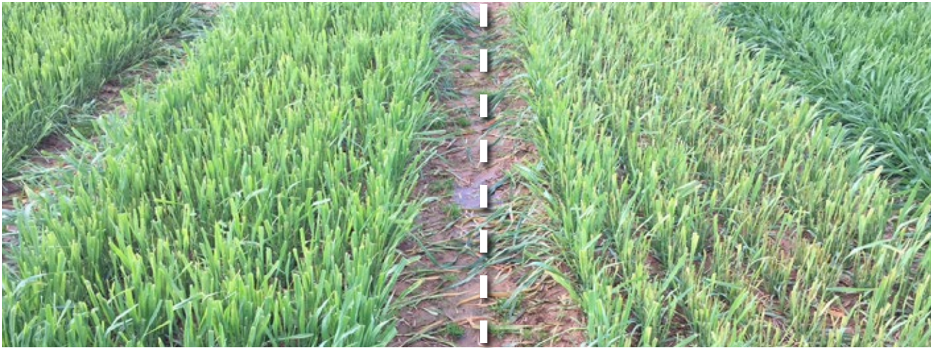
Express (left) and Forester (right). Express demonstrating more winter yield and greater recovery after grazing.