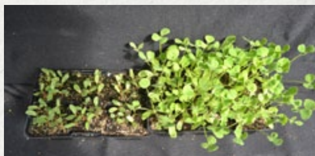
L: Caliph (intolerant),