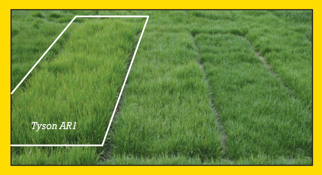
Tyson AR1 in trial (left plot) in September, showing its significant extra early growth through August and September versus other leading perennial ryegrass cultivars.

Tyson is a terrific fit for sheep and beef systems, where additional dry matter available earlier in the spring means more feed available through lambing. Capturing this advantage in your farm system will translate into more lambs finished at weaning, and higher lamb weights.