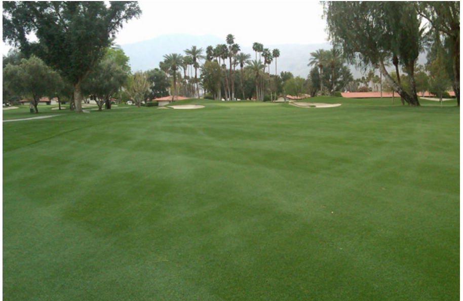
Top Gun II in California