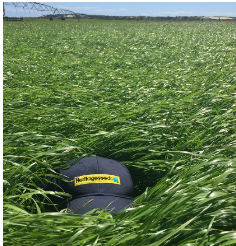
Tempo Italian ryegrass, Tasmania January 2017