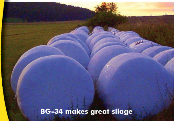
BG-34 makes great silage

BG-34 excels when grown in fertile, well-drained soils. Adequate fertility promotes summer production. It can also survive in heavy soils with periodic standing water. Ideal pH for growing BG-34 is 6.0 to 7.0.