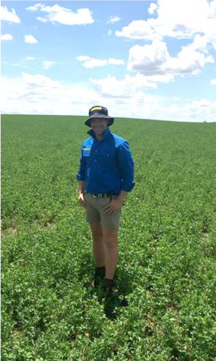
Early seedling establishment approximately three months after sowing. South east South Australia 2017

Heritage 10 has performed well in various trials thus far. Ongoing work is being conducted to assess its long term performance.