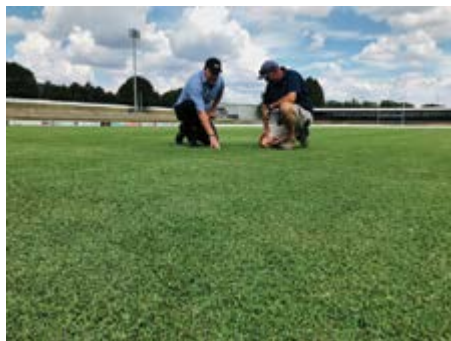
Monaco and Maya sportsfield - ACT