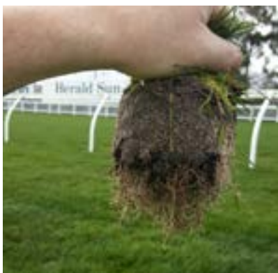
▲ RPR strong root growth.