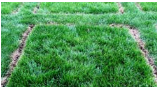
▲ Leading racetrack performance Bealey ryegrass.