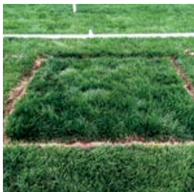
▲ RPR trial at Moonee Valley showing its dense dark appeal.