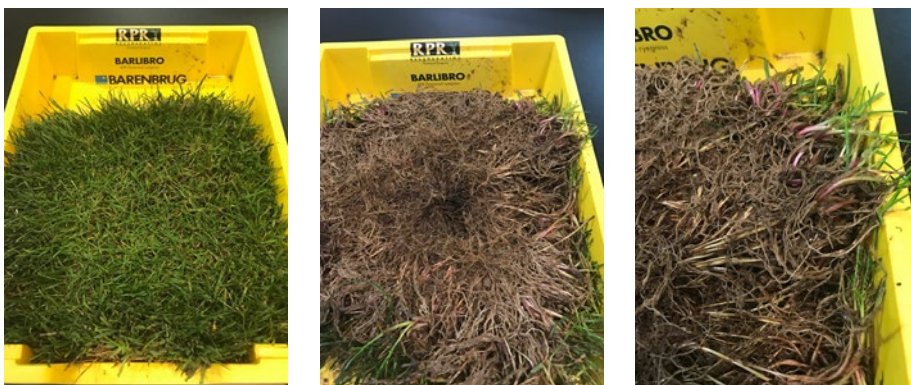
Figure 2 Photographs of a 15-month old Barlibro plant grown from a single seed.

Barlibro is a Regenerating Perennial Ryegrass (RPR) that produces stolons as it establishes and grows. Figure 2 shows a RPR plant grown for a single seed at 15 months old. The stolons and new secondary branches of growth can be seen clearly. The lateral growth habit results in fast establishment between seeding lines, unparalleled capacity for recovery from wear, and additional traction strength in the sward.