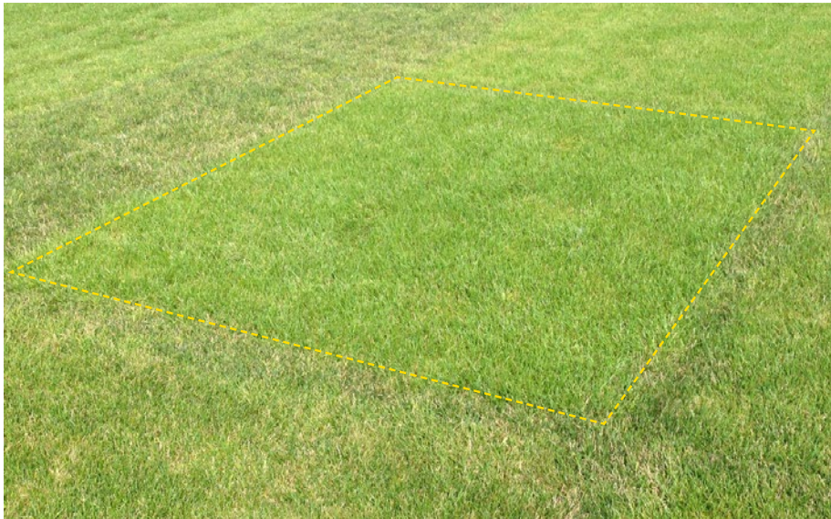
Figure 1 Picture of forage perennial (above) in bar sprint at our Cropvale Research Site, maintained at 60mm height of cut.

Barlibro is a Regenerating Perennial Ryegrass (RPR) that produces stolons as it establishes and grows. Figure 2 shows a RPR plant grown for a single seed at 15 months old. The stolons and new secondary branches of growth can be seen clearly. The lateral growth habit results in fast establishment between seeding lines, unparalleled capacity for recovery from wear, and additional traction strength in the sward.