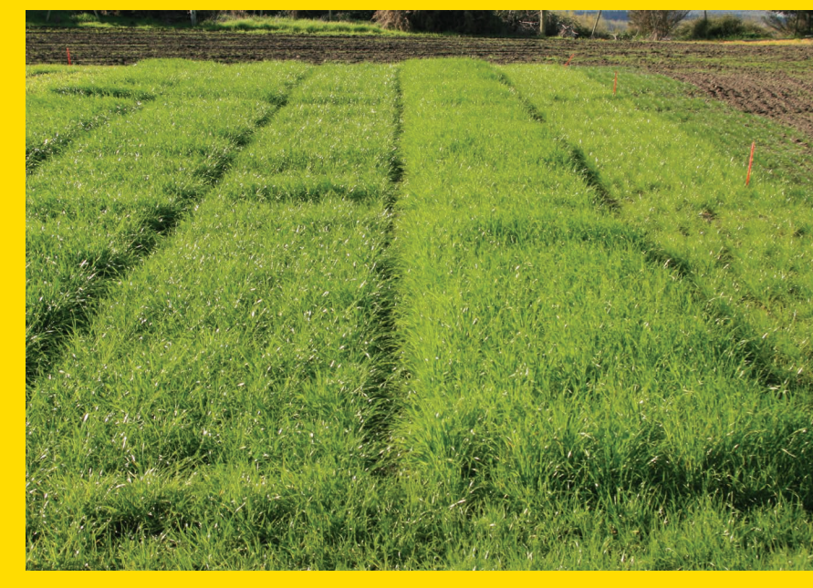
Much faster establishment of a strip of Tabu+ (R) versus uncertified Italian ryegrass (L).

To work out the value of Tabu+ in a farm operation, use our calculator. This is available from your local reseller, or you can download it from agriseeds.co.nz.