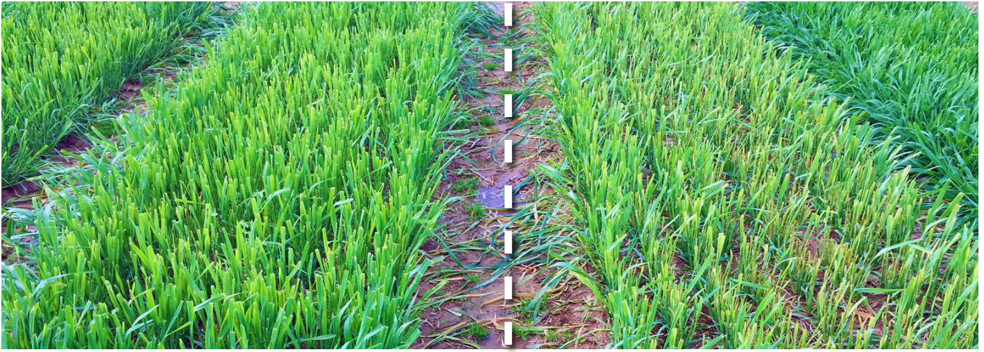
Express (left) and Forester (right). Express demonstrating more winter yield and greater recovery after grazing.